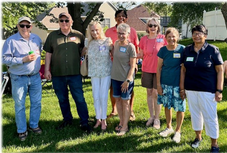
Original Williamsburg Homeowners in Attendance