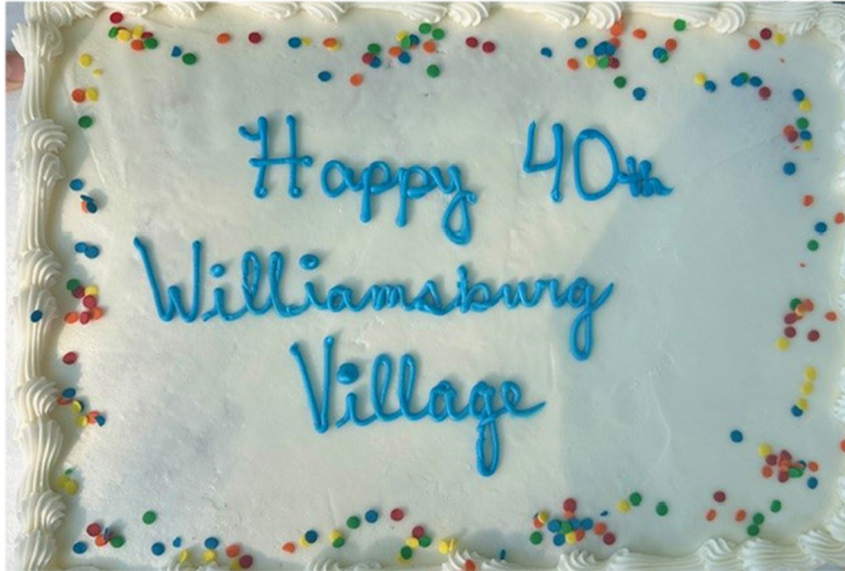
Plenty of great food was shared, with a 40 th Anniversary Cake to 'top it off'

It was a time to reflect, visit with our neighbors, meet new neighbors and celebrate 40 Years as a Community.